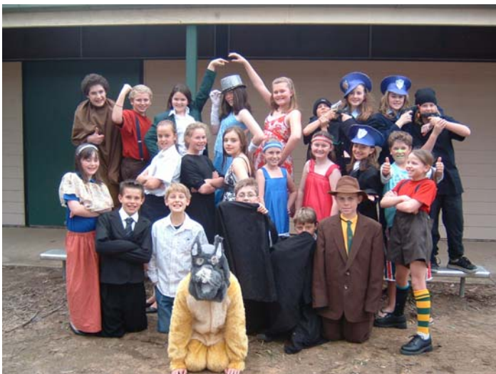
The Dance/Drama Group cast of 'Bats'

BASIC SKILLS TESTING: Parents of students in Year 3 and 5 are reminded that on the Basic Skills Test days, (Tuesday and Thursday next week), that testing sessions commence promptly at 9:00 am. Any students arriving late will be disadvantaged and also may disturb others sitting the test.